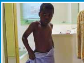
The bathroom and laundry