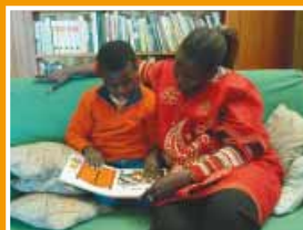
The living room and bedroom