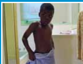
The bathroom and laundry